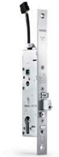
IQ lock EL DL motor lock