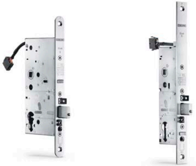
Mechanical panic lock for simple panic functions on double leaf doors