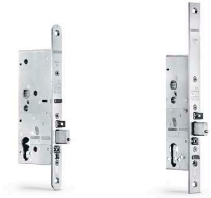
Mechanical panic lock for simple panic functions on double leaf doors