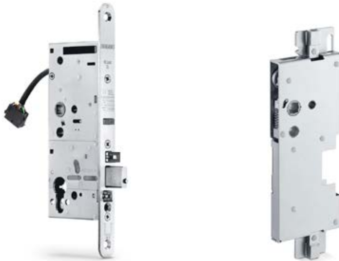
Electromechanical motor lock for combination with swing door drives on double leaf doors