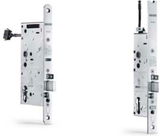
Electromechanical motor lock for combination with swing door drives on single leaf doors