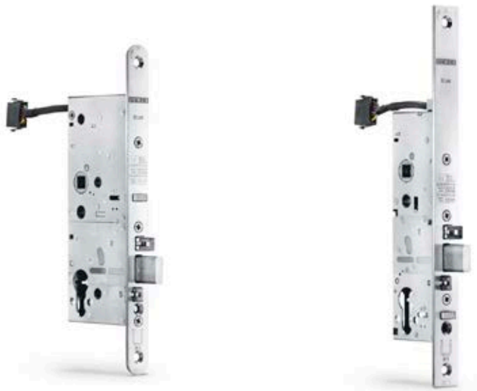
Electromechanical lever lock for combination with access control systems on single leaf doors