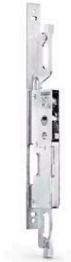
Strike box DL