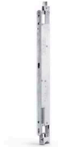
Rod drive IQ AUT